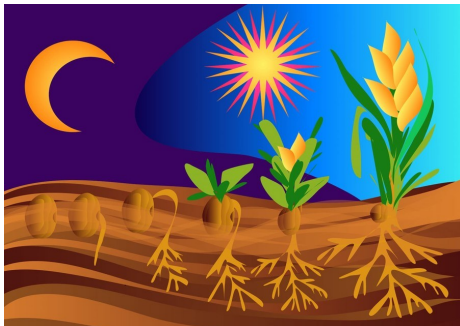
"Seeds of Hope"