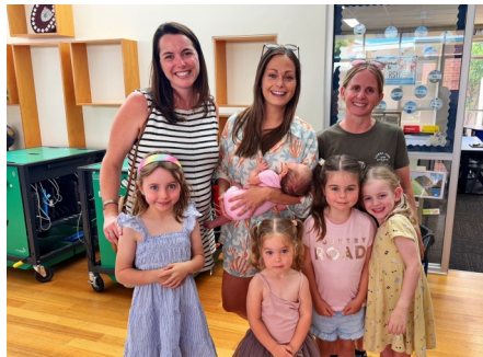
Many families attended our Open Classrooms